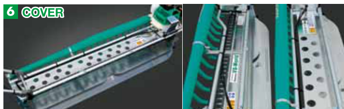
Plate material change aluminum from plastic. It can cover whole width between frame s. It's improved for user safety.