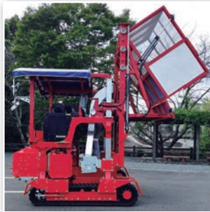
Original container opening and closing mechanism