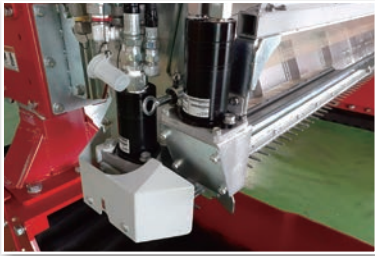
Amazing sharpness by OCHIAI original reciprocating blades