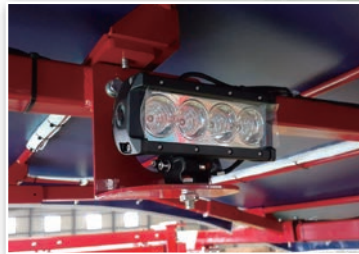
LED rights standard equipment