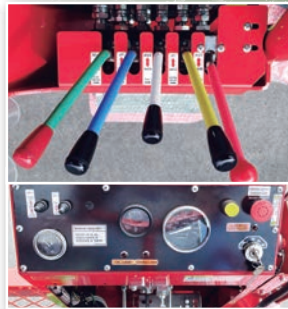
The operation is simple