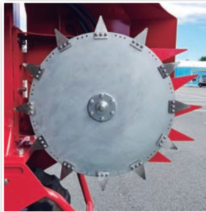
Side cutter can be mounted